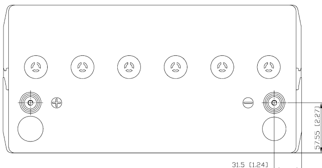
Detail A Drawing(4:1)